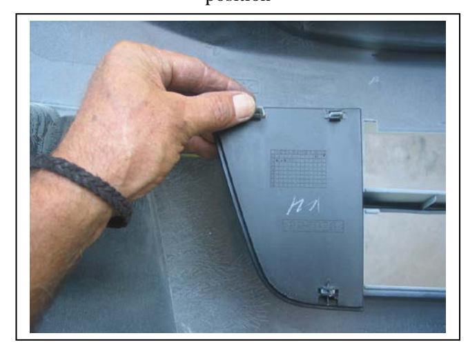
Figure 4: Remove passengers side blanking plate