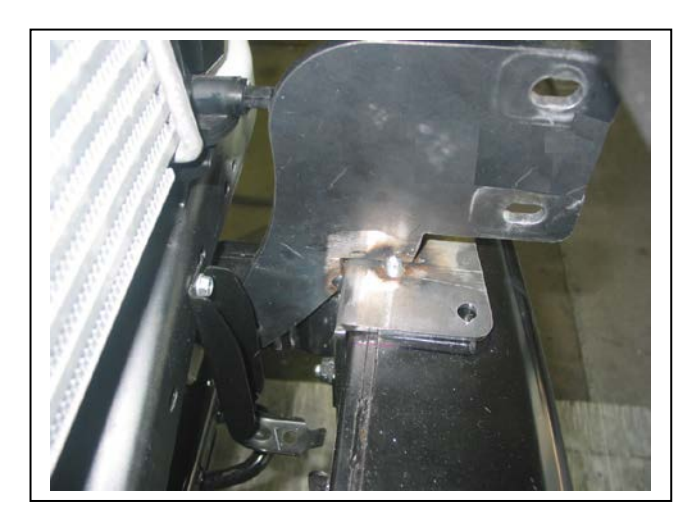
Figure 2: Passengers side mounting bracket in position