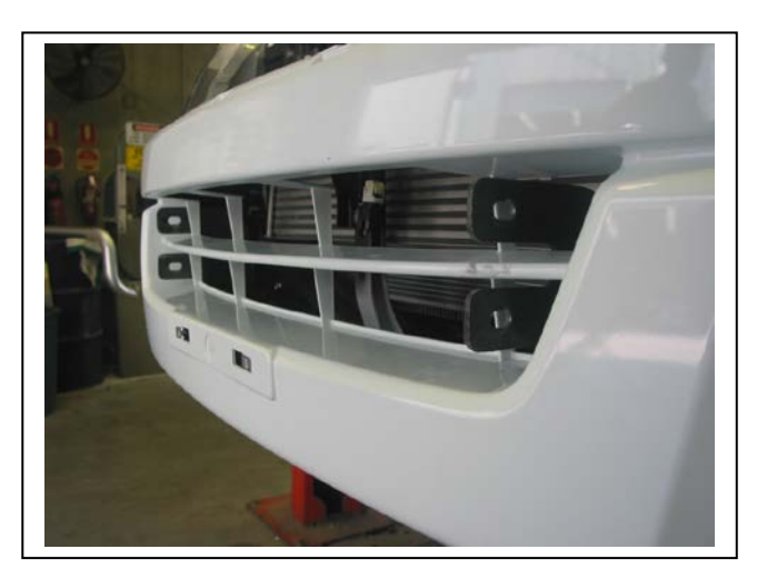
Figure 5: ECB steel mounts with bumper fitted. Isuzu Dmax shown