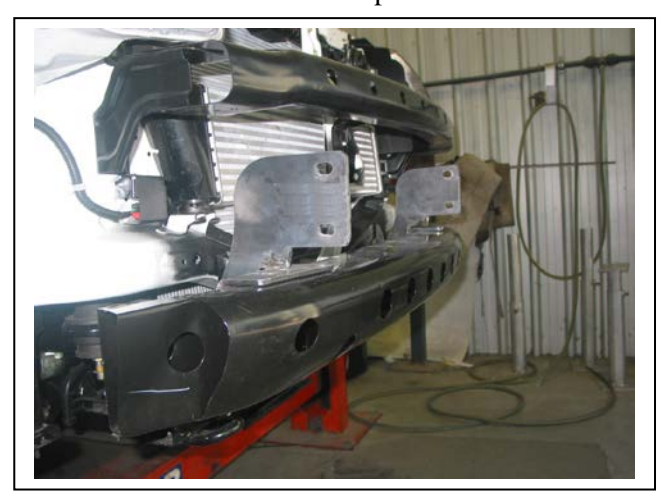
Figure 3: ECB steel mounting brackets fitted.